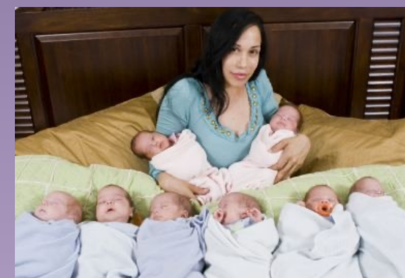
Assisted Reproductive Technology