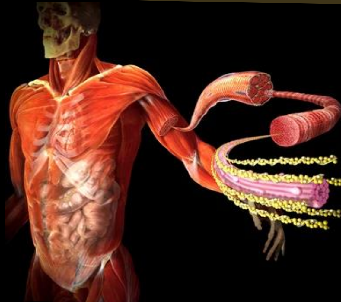
BLOCK 2 SKELETAL MUSCLE