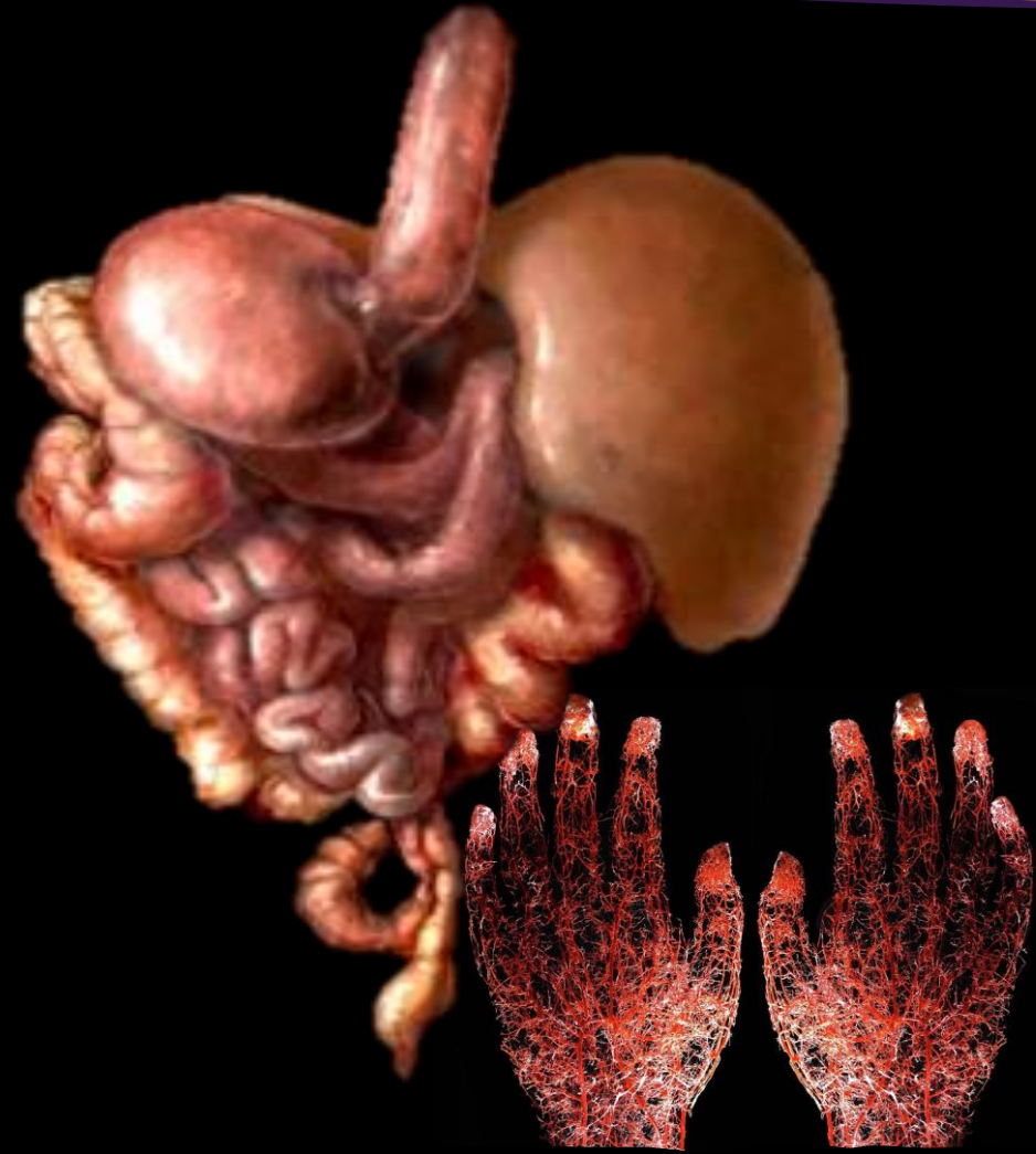
BLOCK 1 SMOOTH MUSCLE

Learn to better understand the systems that move us.